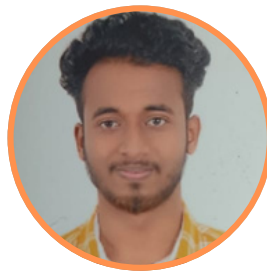
Mr. Akshya Kumar